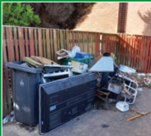
3 Years Old Rubbish Moved