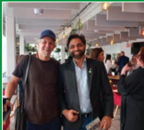
Celebrating the Launch of Bolton Town of Culture