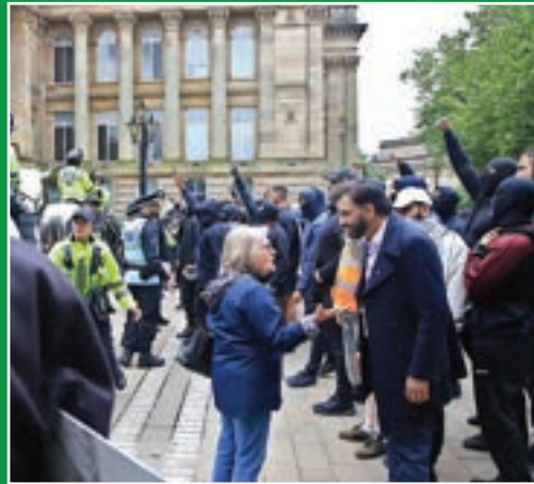
On the front line with police and protesters to calm things down