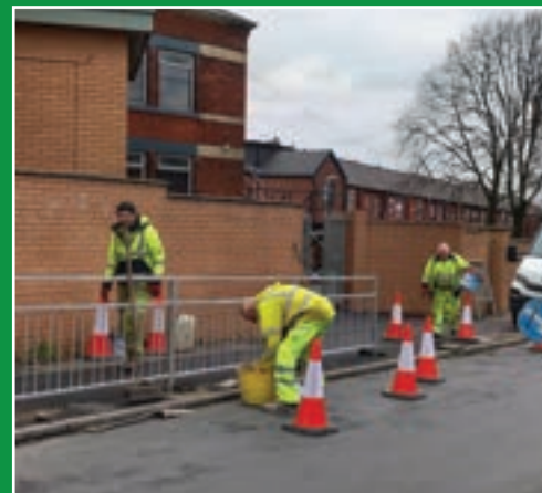
Ensuring the Security of Our Children Around Busy Roads