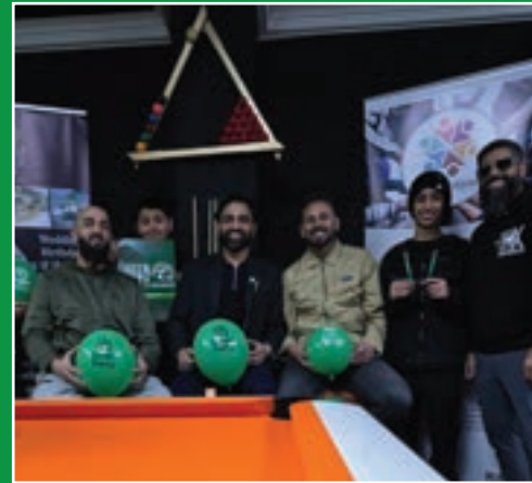
Supporting young people's facilities