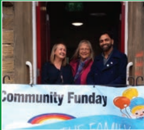
Helping Local Community Centre's