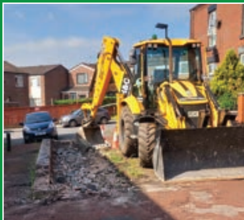
Creating New Access for Residents & Extra Parking